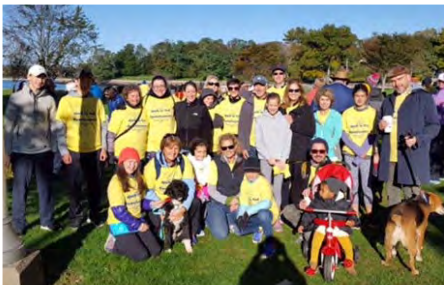
St. Michael's Team raised nearly $2000 at the Family Promise Walk to End Homelessness, October 15. Thank you all who participated!