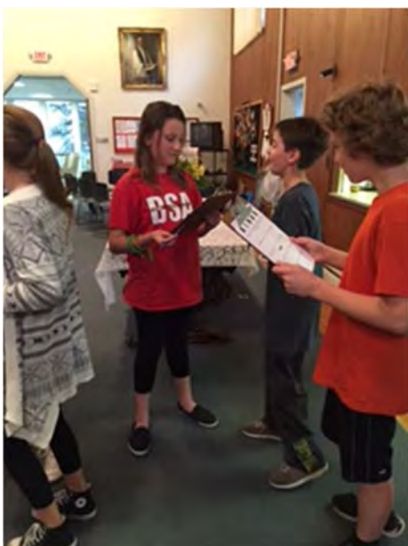
Supper Club participants having fun on October 16.