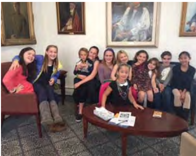
Some of our Intergenerational Service participants Oct. 16, 2016.

Our annual Fall Intergenerational Service took place on Sunday, October 16. Many of the children participated by reading, writing, greeting, collecting and serving. I think everyone who was there would agree that they all did an outstanding job and we should all be very proud! Thank you to the children for their efforts and willingness to participate and to the parents for all their support.