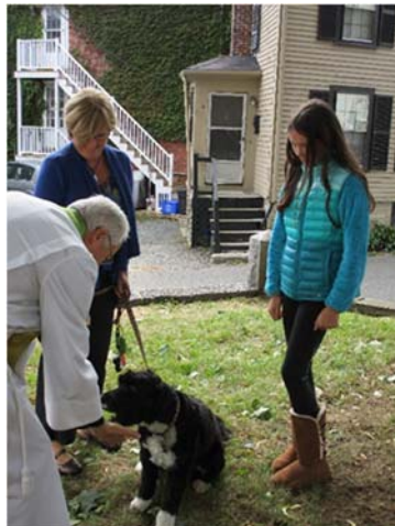
Blessing of the Animals on Sunday, October 4, 2015