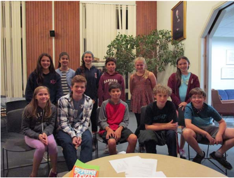
Supper Club 2015-2016 at their first meeting on October 6, 2015