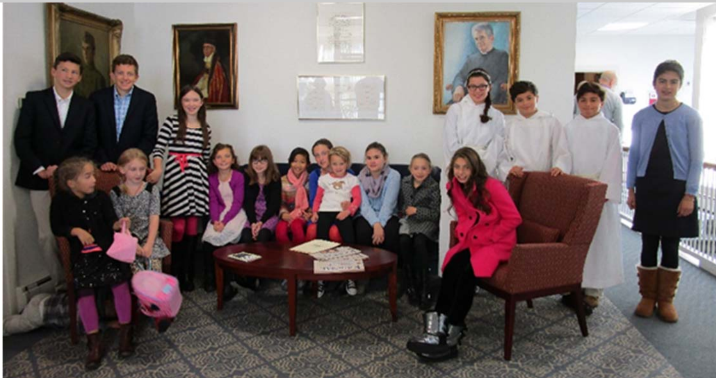
Some of our Intergenerational Service Participants October 18, 2015