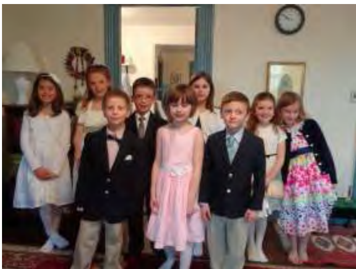
Our nine First Communion recipients.

In May, we will be learning about Pentecost, and Paul spreading the Good News. We will also participate in the Intergenerational Service, will attend the 1928 Historical Service, and will hopefully participate in Rogation Sunday by planting flowers, if the construction materials outside will allow!