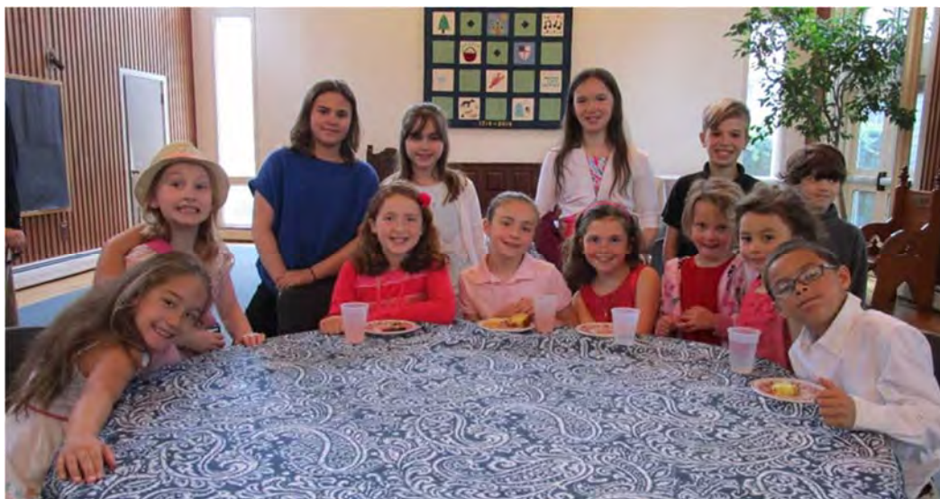
Some of the St. Michael's children and youth that participated in the Intergenerational Service on May 10 th.

Please consider this opportunity to give back to our parish and the children. We will have sign-ups for 2016-2017 Church School volunteers at our June 5th year end celebration and registration day.