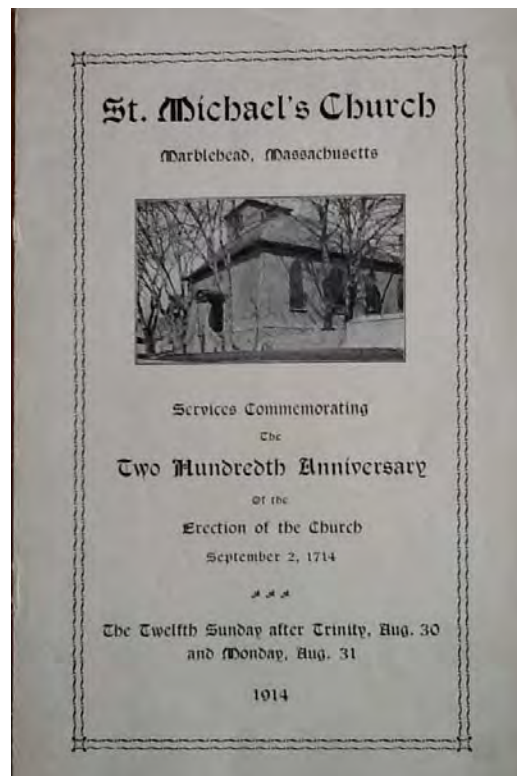
Brochure from St. Michael's Archives.

Sources include "Saint Michael's Two Hundred Years Observed Last Sunday" The Marblehead Messenger, September 4, 1914.