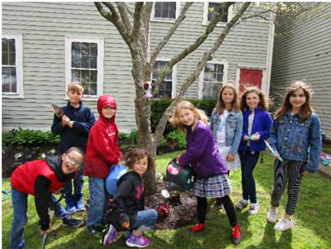
Rogation Sunday – The planting and blessing of the gardens.