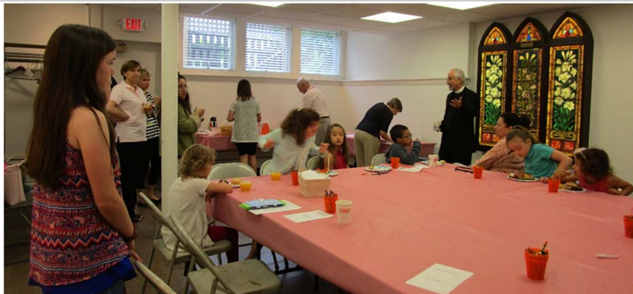
Some of our Church School members celebrate the end of another great year with a special breakfast in the Chapter Room on June 5th.