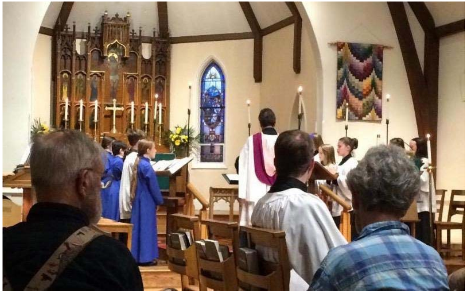
St. Michael's and St. John's youth choirs singing at June 2016 Evensong at St. John's Gloucester.