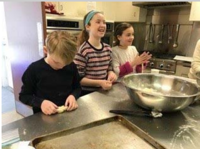
The Church School made delicious pretzels during Lent—an annual tradition at St. Michael's