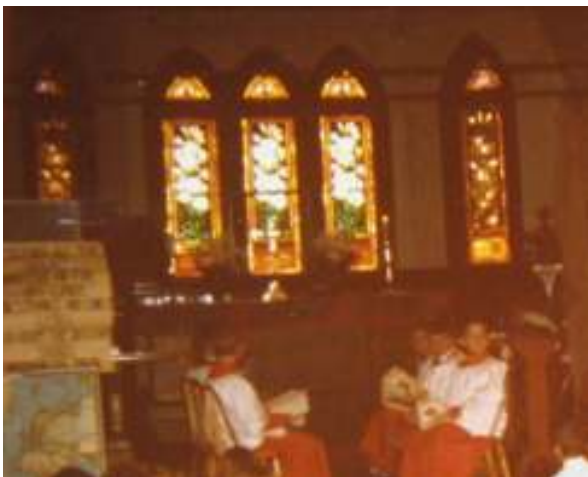
Church School service 1950s-early60s in 1893 Chapel.